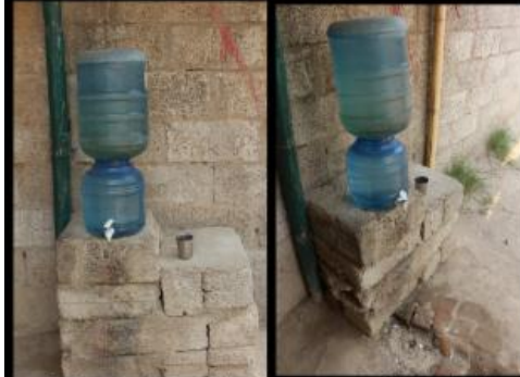
Before condition of drinking station of the School