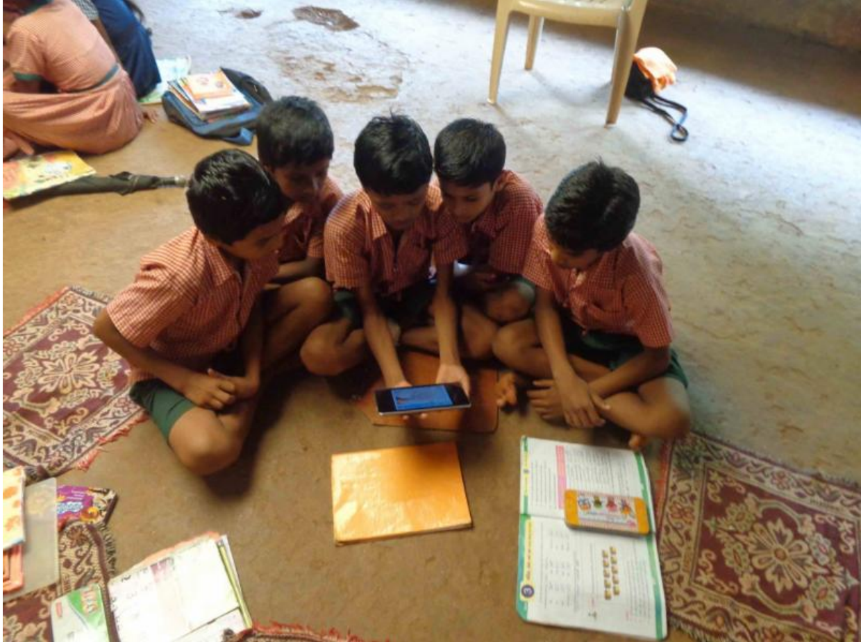
Students in India use tablets to learn English.

"Impact. If there was one word to describe what IEEE has helped me achieve, that would be the one. Creating an impact that matters has been one of the sole motivations throughout my IEEE journey till now."