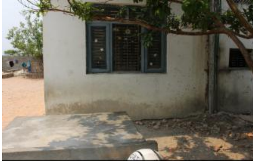
Before Drinking station installation